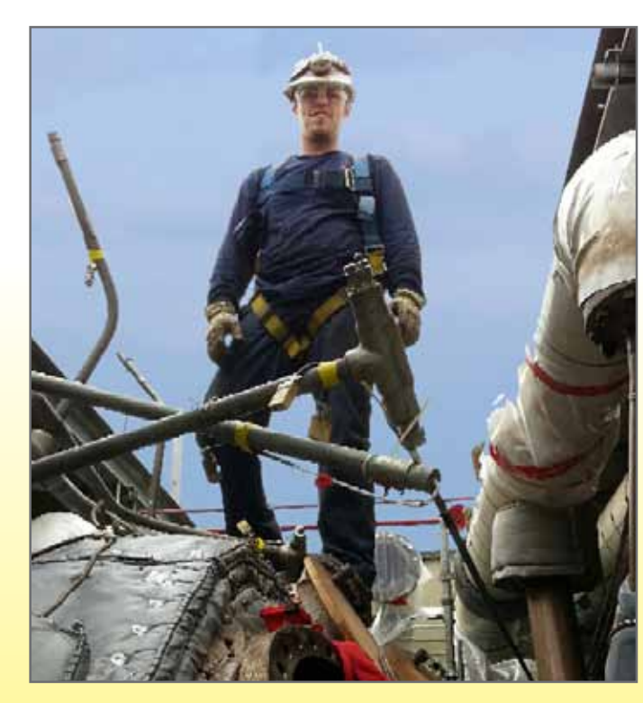
"I absolutely love my job - learn something new every day...and the money helps, too!"

Energy Technicians build, repair, test, and maintain power plant turbines, related energy industry equipment and other industrial machinery. The workplace can be in a variety of sectors such as traditional or renewable generation plants, oil and gas operations, hospitals, waste water treatment facilities, and equipment manufacturers.