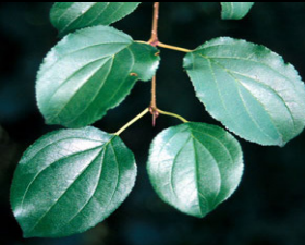
Invasive Species - Common Buckthorn “Rhamnus Cathartica”