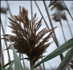
Invasive Species - Phragmites “Phragmites Australis”

Environmental Protection Agency - Green Acres Tip Card